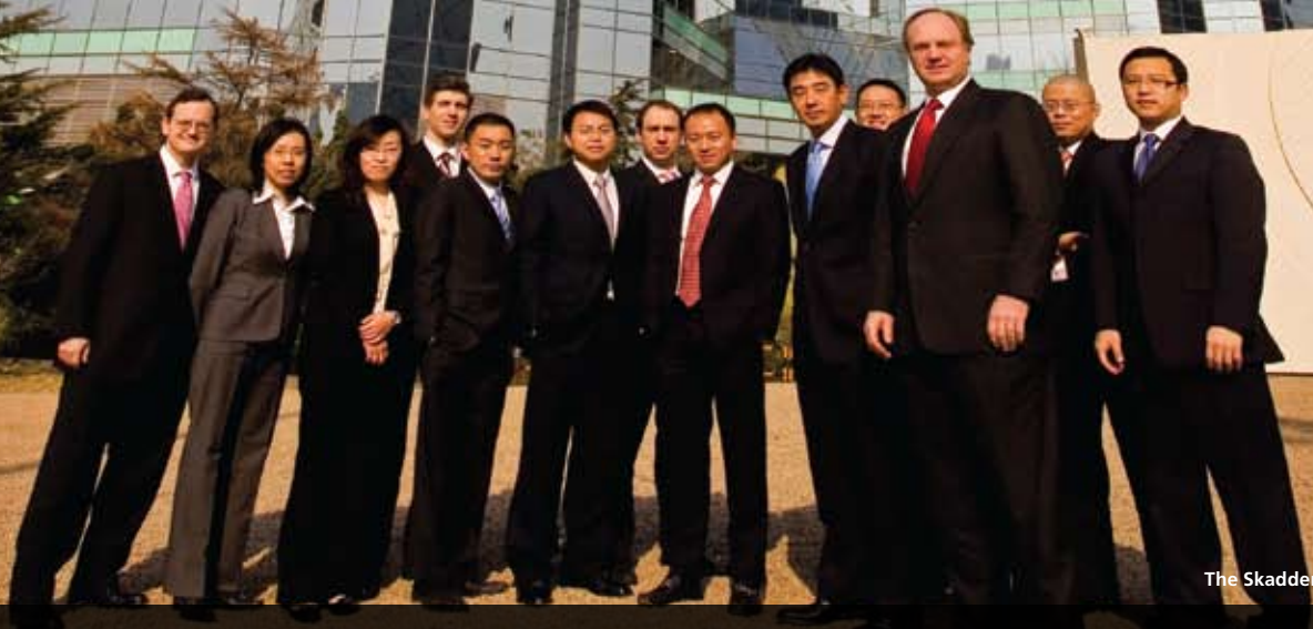
The Skadden Beijing team

Lawyers name the best firms to work for 律师投票评选出年度最佳雇主