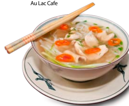
Soup with the lot at Au Lac Cafe