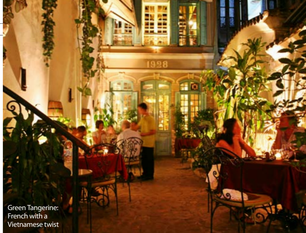
Green Tangerine: French with a Vietnamese twist

For its intoxicating blend of history, humanity and haunting scenery, few Asian cities come close to Hanoi. Like the young oil painters encircling Hoan Kiem Lake, the buzzing metropolis mixes the headiest sights, sounds, smells and tastes from an overloaded palette into experiences that are as rich as they are unique.