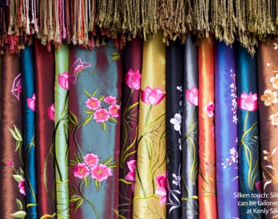
Silken touch: Silk can be tailored at Kenly Silk

rising influx of tourists are collectively driving the city's hospitality, retail and entertainment sectors. Within the high-end market, visitors can choose from an ever-widening array of five-star accommodation, luxury retail and fine-dining options.