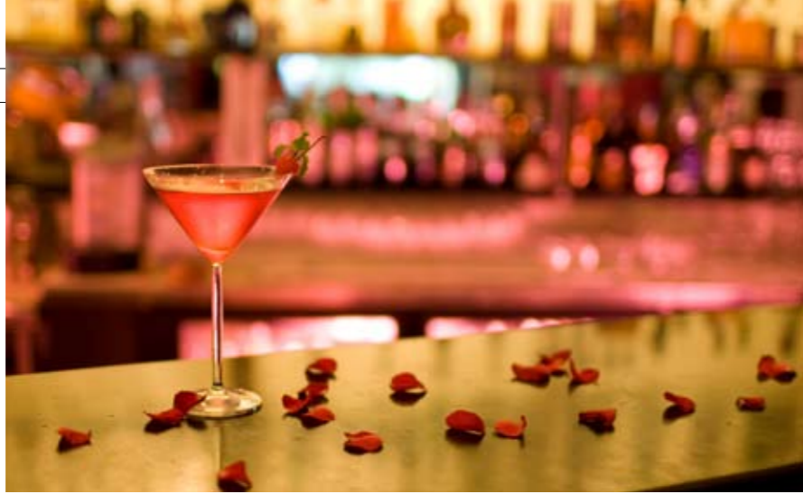
Seasonal martini at Bobby Chinn (left)

Another Hanoi restaurant that constantly wins rave reviews is Bobby Chinn, owned by the extrovert namesake celebrity chef who now has his own television show and cookery book. The restaurant, serving up